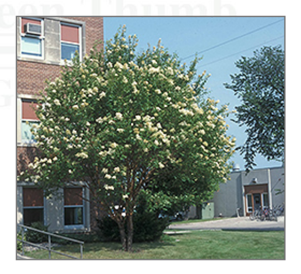
Copper Curls Pekin Lilac in bloom