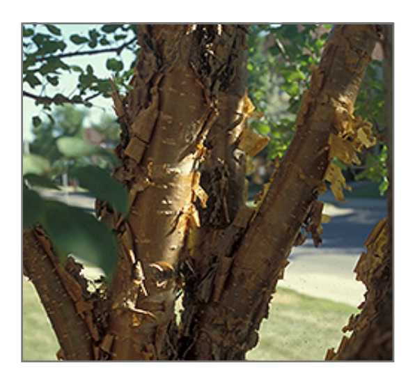
Copper Curls Pekin Lilac bark

Copper Curls Pekin Lilac is a multi-stemmed deciduous tree with an upright spreading habit of growth. Its average texture blends into the landscape, but can be balanced by one or two finer or coarser trees or shrubs for an effective composition.