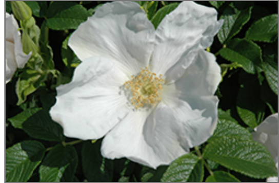
White Rugosa Rose flowers