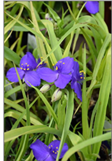
Blue And Gold Spiderwort flowers