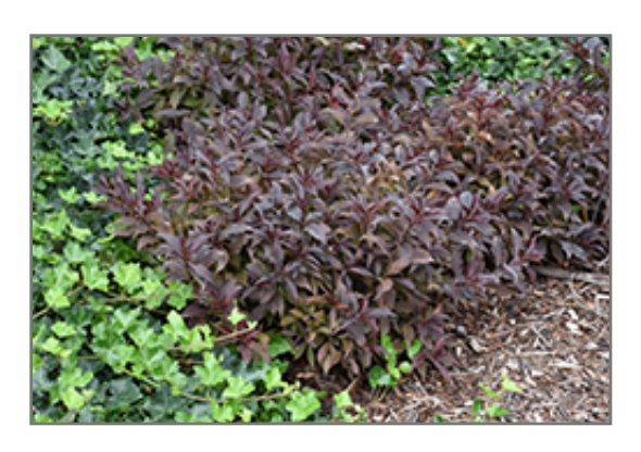
Midnight Wine Weigela

This shrub should only be grown in full sunlight. It prefers to grow in average to moist conditions, and shouldn't be allowed to dry out. It is not particular as to soil type or pH. It is highly tolerant of urban pollution and will even thrive in inner city environments. This is a selected variety of a species not originally from North America.