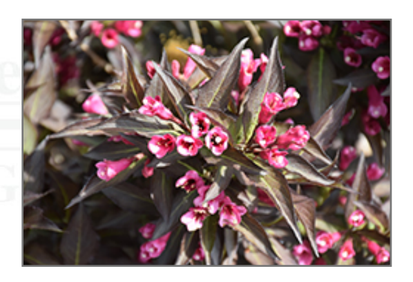
Midnight Wine Weigela flowers