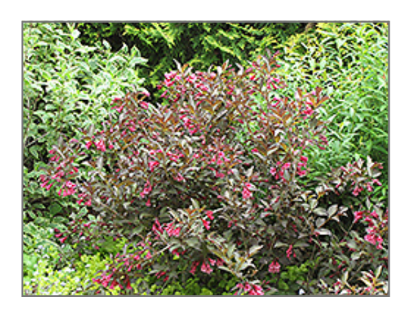
Midnight Wine Weigela in bloom

Midnight Wine Weigela is recommended for the following landscape applications;