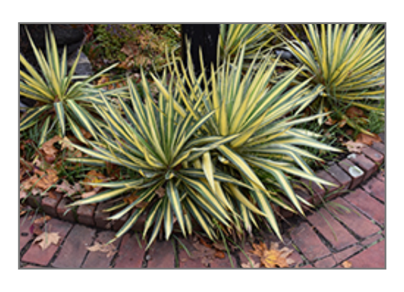
Color Guard Adam's Needle

This shrub will require occasional maintenance and upkeep, and is best pruned in late winter once the threat of extreme cold has passed. Gardeners should be aware of the following characteristic(s) that may warrant special consideration: