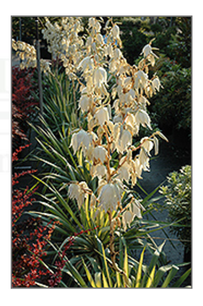
Color Guard Adam's Needle in bloom