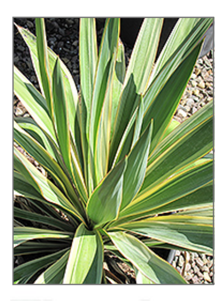
Color Guard Adam's Needle

This shrub should only be grown in full sunlight. It prefers dry to average moisture levels with very well-drained soil, and will often die in standing water. It is considered to be drought-tolerant, and thus makes an ideal choice for a low-water garden or xeriscape application. It is not particular as to soil type or pH. It is somewhat tolerant of urban pollution. This is a selection of a native North American species.