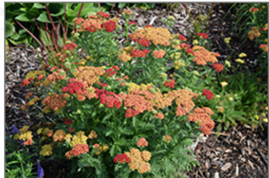
Strawberry Seduction Yarrow in bloom