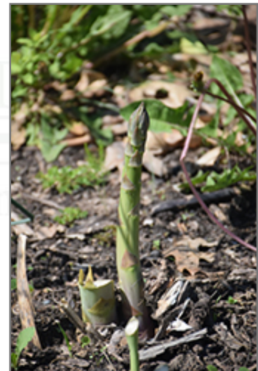
Jersey Giant Asparagus fruit