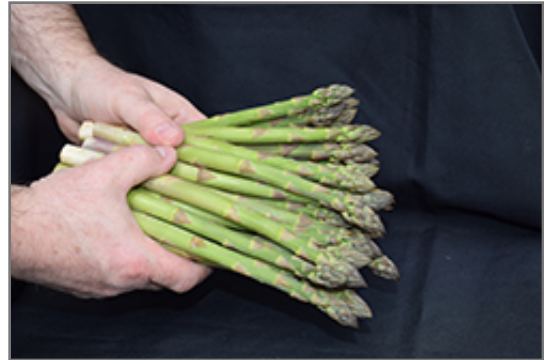
Jersey Giant Asparagus fruit

Jersey Giant Asparagus will grow to be about 4 feet tall at maturity, with a spread of 30 inches. It grows at a medium rate, and under ideal conditions can be expected to live for approximately 15 years. As an herbaceous perennial, this plant will usually die back to the crown each winter, and will regrow from the base each spring. Be careful not to disturb the crown in late winter when it may not be readily seen!