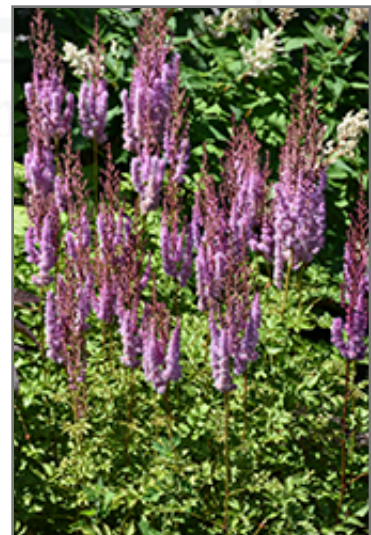
Superba Chinese Astilbe in bloom