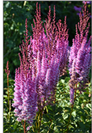
Superba Chinese Astilbe flowers

This is a relatively low maintenance plant, and is best cleaned up in early spring before it resumes active growth for the season. It is a good choice for attracting butterflies to your yard, but is not particularly attractive to deer who tend to leave it alone in favor of tastier treats. It has no significant negative characteristics.