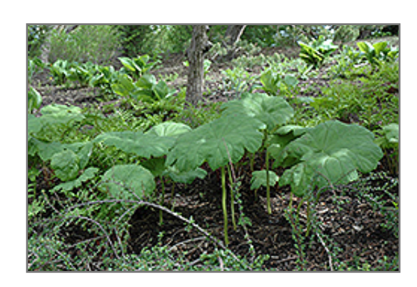
Astilboides foliage

Astilboides is recommended for the following landscape applications;