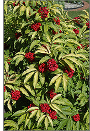
Red Elderberry fruit

Red Elderberry is recommended for the following landscape applications;