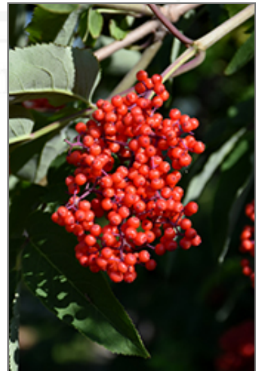
Red Elderberry fruit