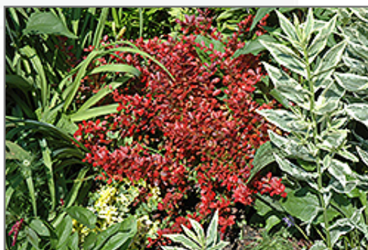
Cherry Bomb Japanese Barberry