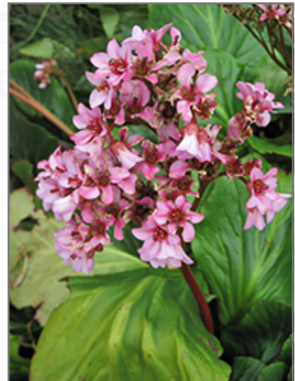
Winter Glow Bergenia flowers