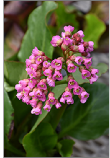
Winter Glow Bergenia flower buds

Winter Glow Bergenia is recommended for the following landscape applications;