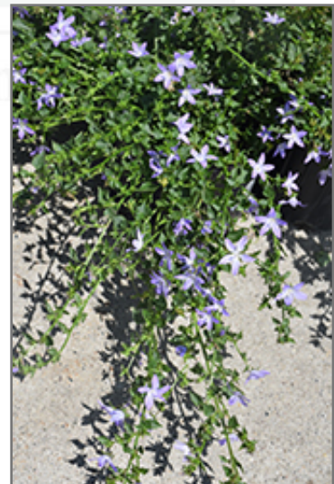
Blue Waterfall Serbian Bellflower in bloom