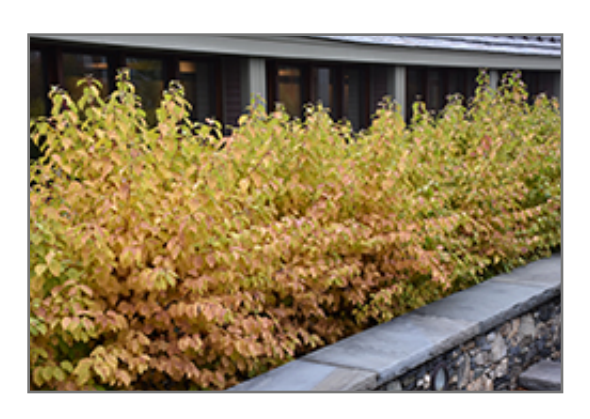
Midwinter Fire Dogwood in fall

Midwinter Fire Dogwood is a dense multi-stemmed deciduous shrub with a more or less rounded form. Its average texture blends into the landscape, but can be balanced by one or two finer or coarser trees or shrubs for an effective composition.