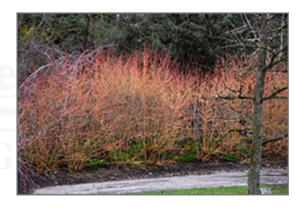
Midwinter Fire Dogwood in winter