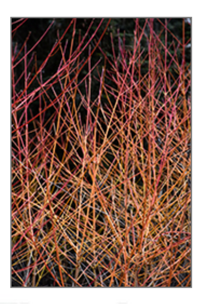
Midwinter Fire Dogwood stems

Midwinter Fire Dogwood will grow to be about 5 feet tall at maturity, with a spread of 5 feet. It tends to fill out right to the ground and therefore doesn't necessarily require facer plants in front, and is suitable for planting under power lines. It grows at a medium rate, and under ideal conditions can be expected to live for approximately 20 years.