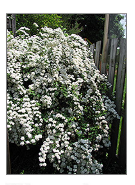
Vanhoutte Spirea in bloom

This shrub will require occasional maintenance and upkeep, and should only be pruned after flowering to avoid removing any of the current season's flowers. It is a good choice for attracting butterflies to your yard, but is not particularly attractive to deer who tend to leave it alone in favor of tastier treats. Gardeners should be aware of the following characteristic(s) that may warrant special consideration: