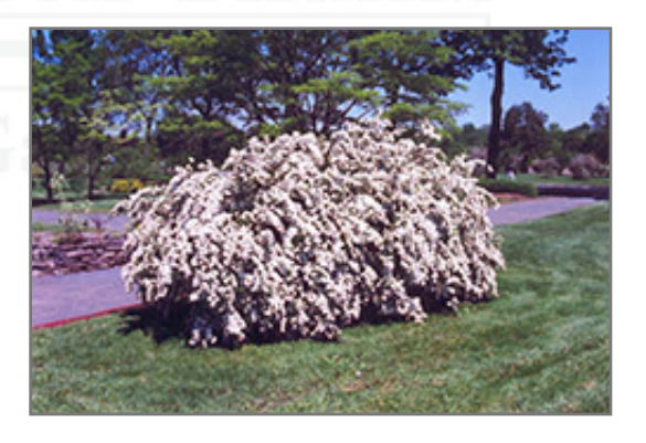
Vanhoutte Spirea in bloom