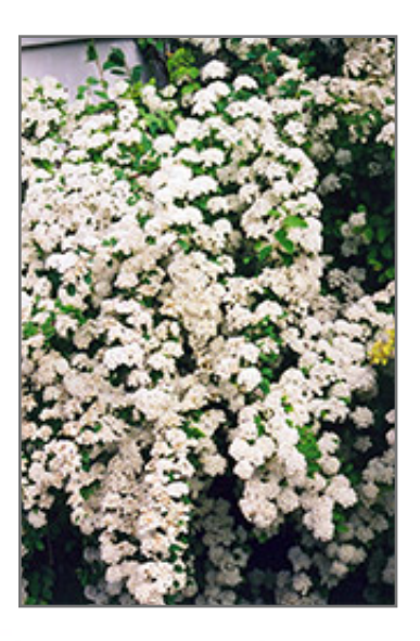
Vanhoutte Spirea flowers

This shrub should only be grown in full sunlight. It prefers to grow in average to moist conditions, and shouldn't be allowed to dry out. It is not particular as to soil type or pH. It is highly tolerant of urban pollution and will even thrive in inner city environments. This particular variety is an interspecific hybrid.