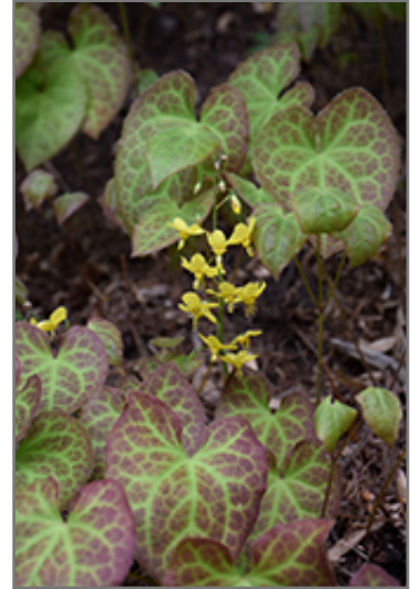
Froehnleiten Bishop's Hat flowers

Froehnleiten Bishop's Hat is a dense herbaceous evergreen perennial with a ground-hugging habit of growth. Its relatively fine texture sets it apart from other garden plants with less refined foliage.