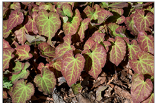
Froehnleiten Bishop's Hat foliage