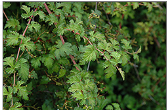
Cutleaf Stephanandra foliage