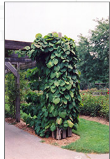
Dutchman's Pipe