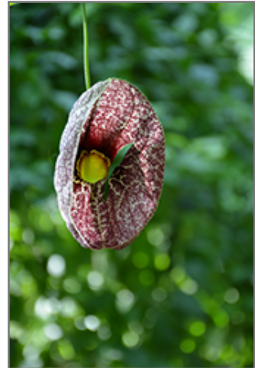
Dutchman's Pipe flowers