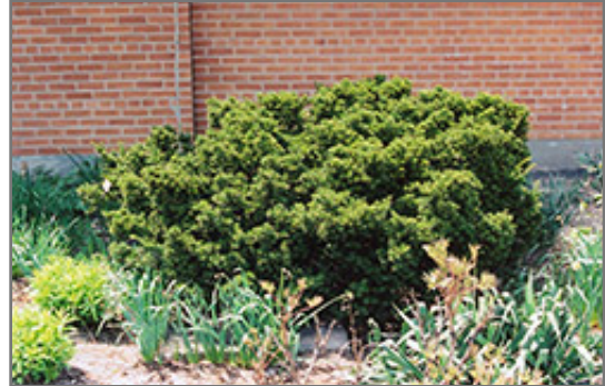
Dwarf Japanese Yew