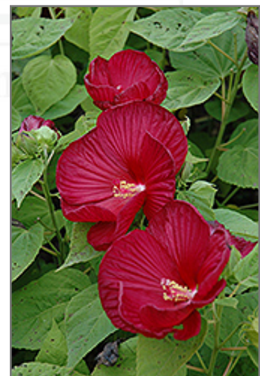
Luna Red Hibiscus flowers