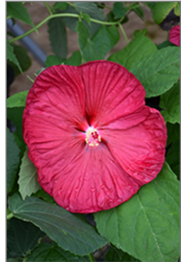
Luna Red Hibiscus flowers

This plant will require occasional maintenance and upkeep, and should be cut back in late fall in preparation for winter. It is a good choice for attracting butterflies and hummingbirds to your yard. Gardeners should be aware of the following characteristic(s) that may warrant special consideration;