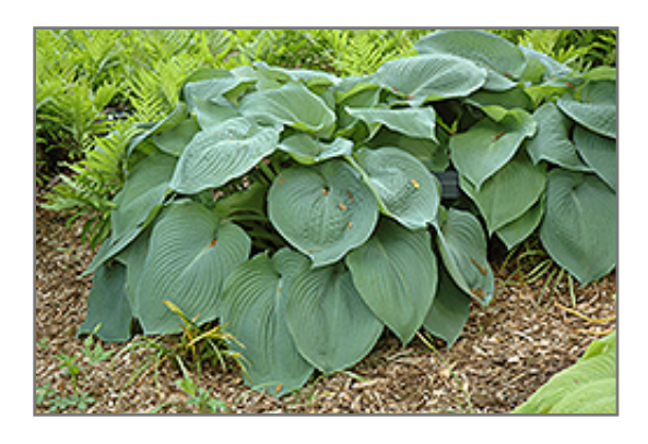
Big Daddy Hosta

This is a relatively low maintenance plant, and is best cleaned up in early spring before it resumes active growth for the season. Gardeners should be aware of the following characteristic(s) that may warrant special consideration;