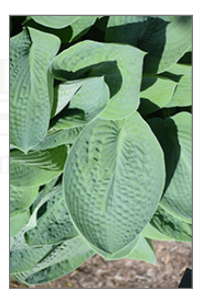
Big Daddy Hosta foliage