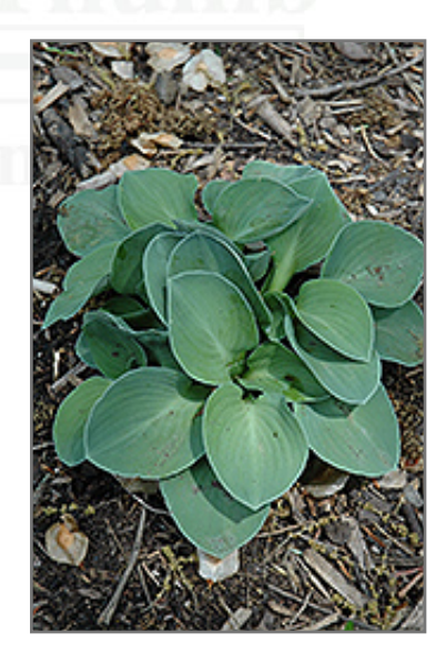
Blue Mouse Ears Hosta