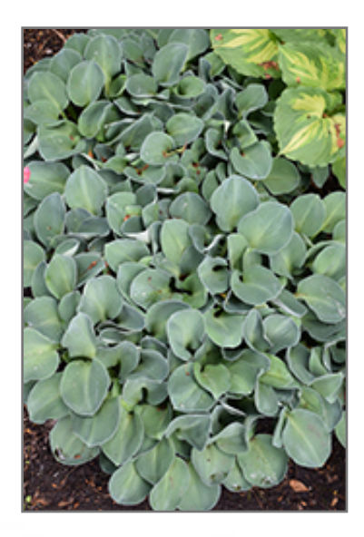
Blue Mouse Ears Hosta

This is a relatively low maintenance plant, and is best cleaned up in early spring before it resumes active growth for the season. Gardeners should be aware of the following characteristic(s) that may warrant special consideration;