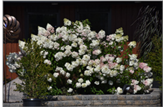
Vanilla Strawberry Hydrangea in bloom

This shrub performs well in both full sun and full shade. It prefers to grow in average to moist conditions, and shouldn't be allowed to dry out. It is not particular as to soil type or pH. It is highly tolerant of urban pollution and will even thrive in inner city environments. Consider applying a thick mulch around the root zone in winter to protect it in exposed locations or colder microclimates. This is a selected variety of a species not originally from North America.