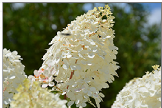
Vanilla Strawberry Hydrangea flowers