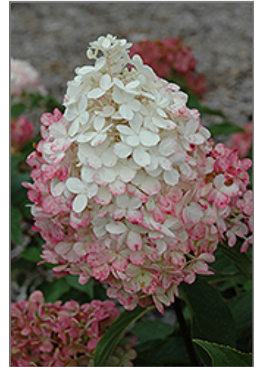
Vanilla Strawberry Hydrangea flowers

Vanilla Strawberry Hydrangea is recommended for the following landscape applications;