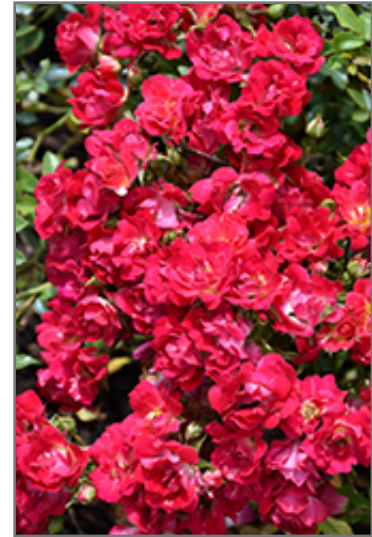
Red Drift Rose flowers

This shrub will require occasional maintenance and upkeep, and is best pruned in late winter once the threat of extreme cold has passed. Gardeners should be aware of the following characteristic(s) that may warrant special consideration;