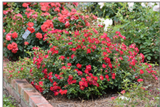
Red Drift Rose in bloom