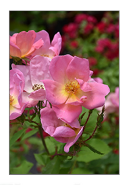
Rainbow Knock Out Rose flowers

Rainbow Knock Out Rose is a multi-stemmed deciduous shrub with an upright spreading habit of growth. Its average texture blends into the landscape, but can be balanced by one or two finer or coarser trees or shrubs for an effective composition.