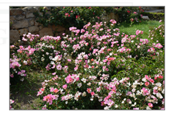
Rainbow Knock Out Rose in bloom