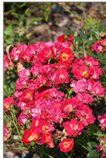
Pink Drift Rose flowers

Pink Drift Rose is a multi-stemmed deciduous shrub with a ground-hugging habit of growth. Its average texture blends into the landscape, but can be balanced by one or two finer or coarser trees or shrubs for an effective composition.