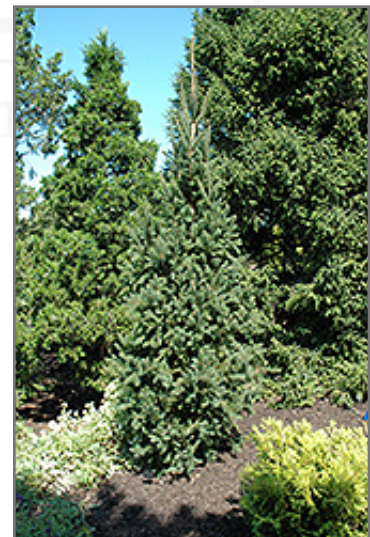
Columnar Norway Spruce