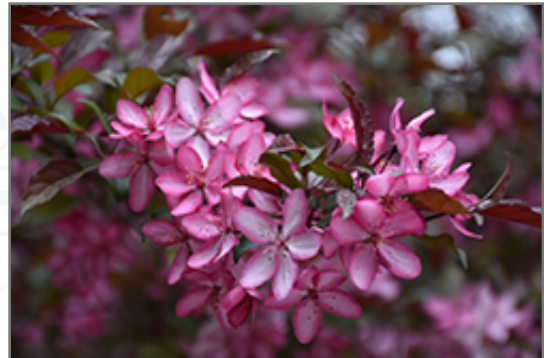
Royal Raindrops Flowering Crab flowers