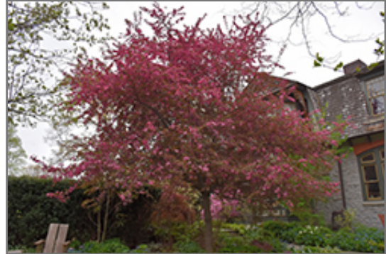
Royal Raindrops Flowering Crab in bloom

This tree will require occasional maintenance and upkeep, and is best pruned in late winter once the threat of extreme cold has passed. It is a good choice for attracting birds to your yard. It has no significant negative characteristics.