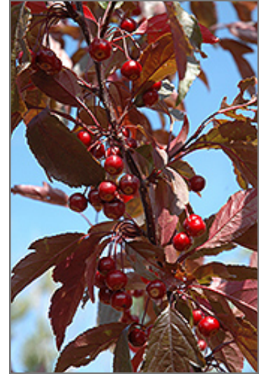
Royal Raindrops Flowering Crab fruit

This tree should only be grown in full sunlight. It prefers to grow in average to moist conditions, and shouldn't be allowed to dry out. It is not particular as to soil type or pH. It is highly tolerant of urban pollution and will even thrive in inner city environments. This particular variety is an interspecific hybrid.