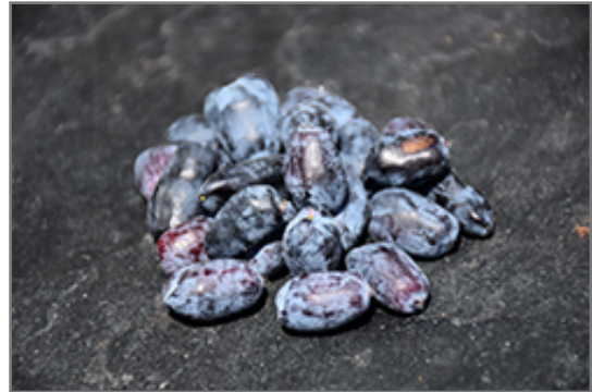
Berry Smart Blue Honeyberry fruit