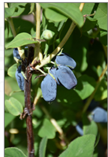
Berry Smart Blue Honeyberry fruit