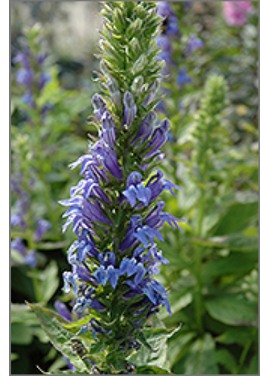
Blue Cardinal Flower flowers

Blue Cardinal Flower is recommended for the following landscape applications;