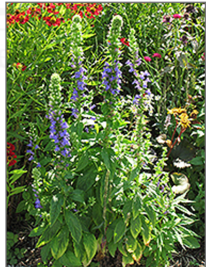
Blue Cardinal Flower in bloom