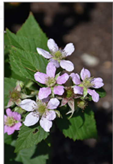
Chester Thornless Blackberry flowers