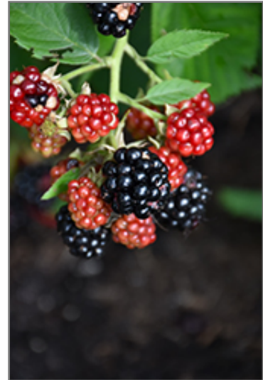
Chester Thornless Blackberry fruit