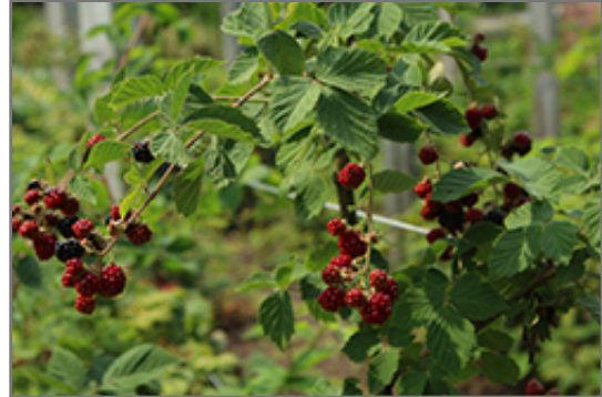
Chester Thornless Blackberry fruit

This shrub may not always play well with others; as such, it is best grown in its own designated garden space or isolated area of an edibles garden. It should only be grown in full sunlight. It prefers to grow in average to moist conditions, and shouldn't be allowed to dry out. It is not particular as to soil type or pH. It is somewhat tolerant of urban pollution. This particular variety is an interspecific hybrid. It can be propagated by division; however, as a cultivated variety, be aware that it may be subject to certain restrictions or prohibitions on propagation.