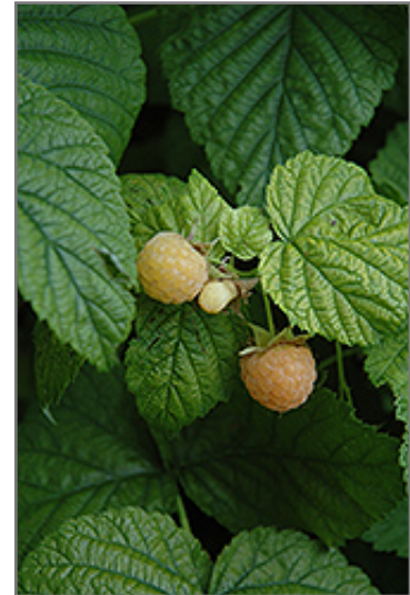
Fall Gold Raspberry fruit

Fall Gold Raspberry has rich green deciduous foliage on a plant with an upright spreading habit of growth. The fuzzy oval compound leaves do not develop any appreciable fall colour. It features an abundance of magnificent gold berries with yellow overtones from early summer to early fall.