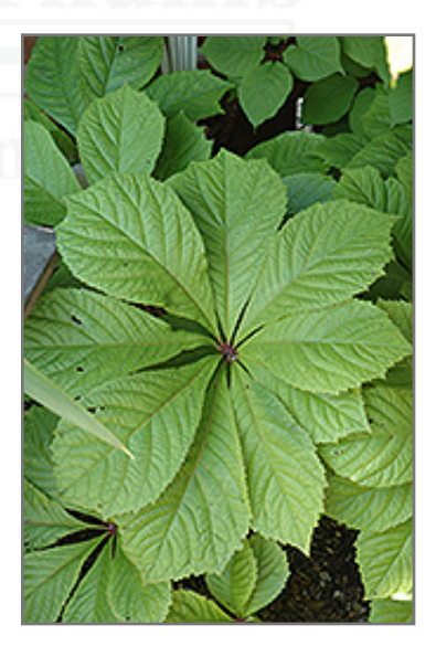
Chestnut Rodgersia

This is a relatively low maintenance plant, and should be cut back in late fall in preparation for winter. Deer don't particularly care for this plant and will usually leave it alone in favor of tastier treats. It has no significant negative characteristics.