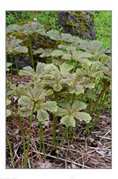
Chestnut Rodgersia

This plant does best in partial shade to shade. It prefers to grow in moist to wet soil, and will even tolerate some standing water. It is not particular as to soil pH, but grows best in rich soils. It is somewhat tolerant of urban pollution. Consider applying a thick mulch around the root zone over the growing season to conserve soil moisture. This species is not originally from North America. It can be propagated by division.