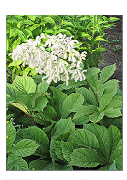
Chestnut Rodgersia flowers

Resembling leaves of a horse-chestnut, this Chinese native requires a large area to grow and display its huge plumes of creamy-white flowers that tower above the large leaves; even one is an ideal specimen in the garden