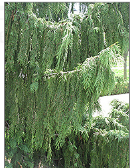
Nootka Cypress foliage