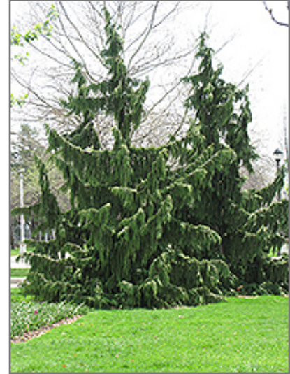
Nootka Cypress

Nootka Cypress is recommended for the following landscape applications;