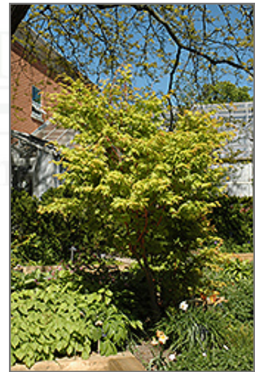
Coral Bark Japanese Maple