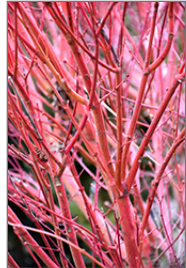
Coral Bark Japanese Maple stems

This tree does best in full sun to partial shade. You may want to keep it away from hot, dry locations that receive direct afternoon sun or which get reflected sunlight, such as against the south side of a white wall. It prefers to grow in average to moist conditions, and shouldn't be allowed to dry out. It is not particular as to soil pH, but grows best in rich soils. It is somewhat tolerant of urban pollution, and will benefit from being planted in a relatively sheltered location. Consider applying a thick mulch around the root zone in winter to protect it in exposed locations or colder microclimates. This is a selected variety of a species not originally from North America.