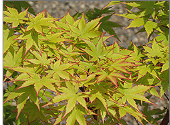
Coral Bark Japanese Maple foliage

This is a relatively low maintenance tree, and should only be pruned in summer after the leaves have fully developed, as it may 'bleed' sap if pruned in late winter or early spring. It has no significant negative characteristics.