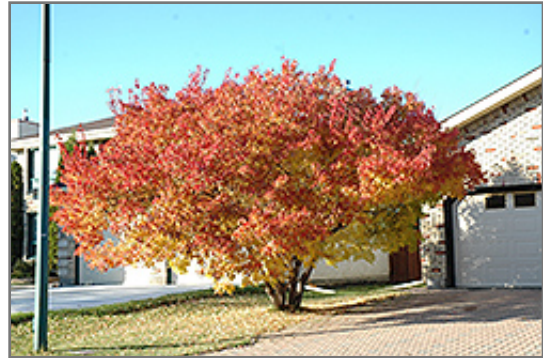
Amur Maple (multi-stem) in fall

Amur Maple (multi-stem) is recommended for the following landscape applications;