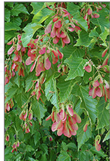
Amur Maple (multi-stem) fruit