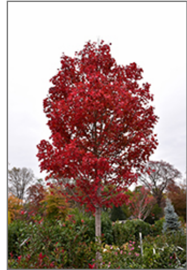
October Glory Red Maple in fall

October Glory Red Maple is recommended for the following landscape applications;