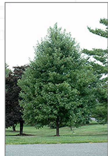
October Glory Red Maple