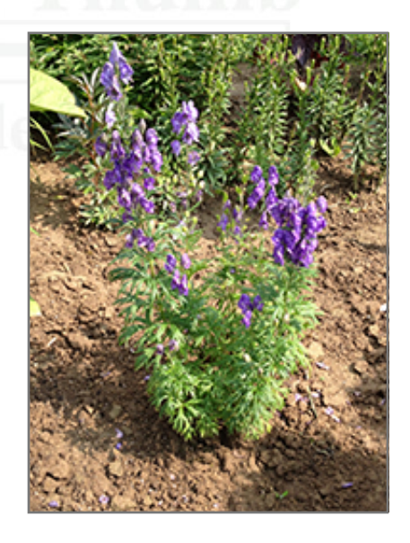
Azure Monkshood in bloom