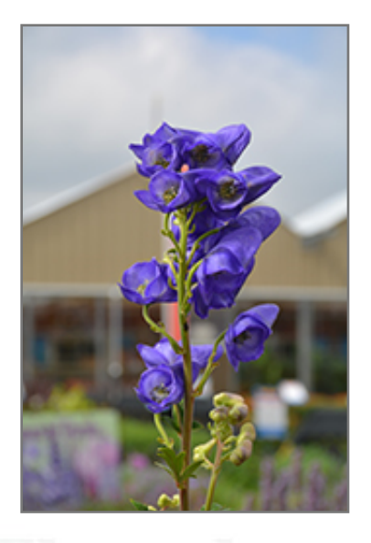
Azure Monkshood flowers

Azure Monkshood is recommended for the following landscape applications;