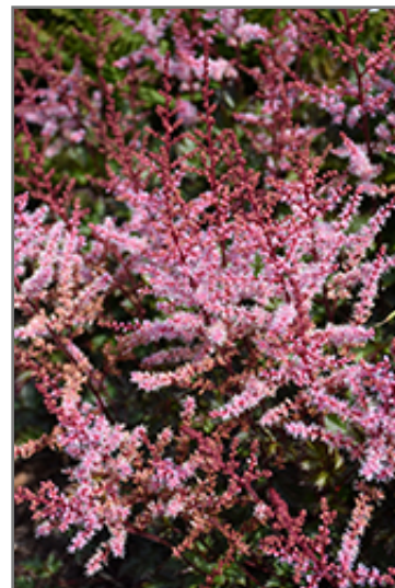
Delft Lace Astilbe flowers

Delft Lace Astilbe is an herbaceous perennial with an upright spreading habit of growth. Its relatively fine texture sets it apart from other garden plants with less refined foliage.