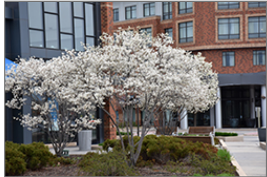
Autumn Brilliance Serviceberry in bloom

This is a relatively low maintenance tree, and is best pruned in late winter once the threat of extreme cold has passed. It is a good choice for attracting birds to your yard, but is not particularly attractive to deer who tend to leave it alone in favor of tastier treats. It has no significant negative characteristics.