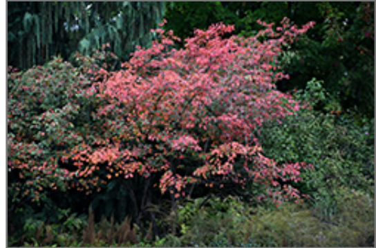
Autumn Brilliance Serviceberry in fall

Autumn Brilliance Serviceberry will grow to be about 25 feet tall at maturity, with a spread of 20 feet. It has a low canopy with a typical clearance of 4 feet from the ground, and is suitable for planting under power lines. It grows at a medium rate, and under ideal conditions can be expected to live for 40 years or more.