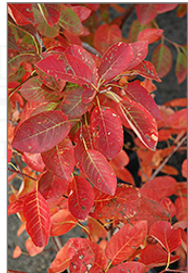
Autumn Brilliance Serviceberry in fall