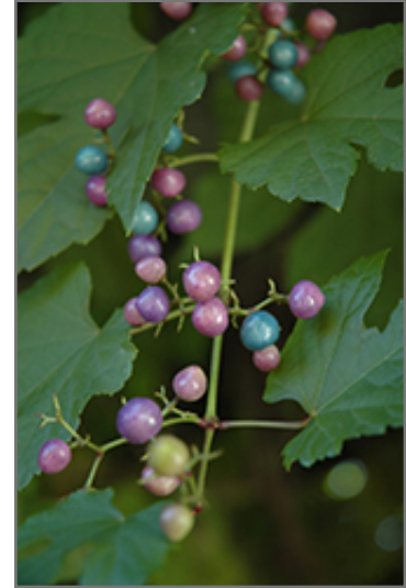
Elegans Porcelain Berry fruit

This woody vine does best in full sun to partial shade. It is very adaptable to both dry and moist locations, and should do just fine under average home landscape conditions. It is not particular as to soil type or pH. It is highly tolerant of urban pollution and will even thrive in inner city environments. This is a selected variety of a species not originally from North America.