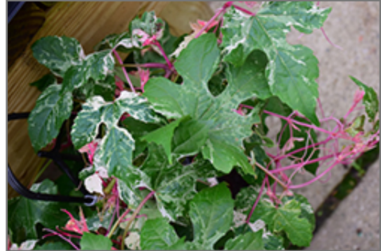
Elegans Porcelain Berry foliage