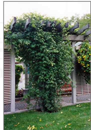
Elegans Porcelain Berry