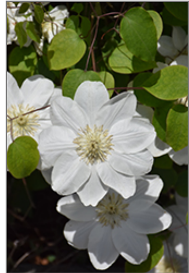
Guernsey Cream Clematis flowers

Guernsey Cream Clematis is recommended for the following landscape applications;