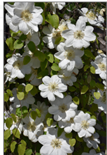
Guernsey Cream Clematis flowers