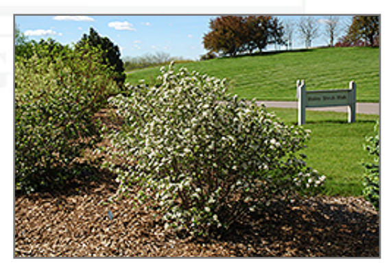
Autumn Magic Black Chokeberry in bloom