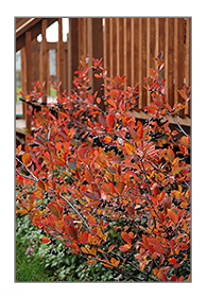
Autumn Magic Black Chokeberry in fall

This shrub will require occasional maintenance and upkeep, and is best pruned in late winter once the threat of extreme cold has passed. Gardeners should be aware of the following characteristic(s) that may warrant special consideration;