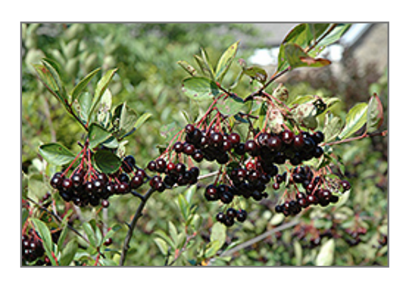
Autumn Magic Black Chokeberry fruit

Autumn Magic Black Chokeberry will grow to be about 4 feet tall at maturity, with a spread of 3 feet. It tends to be a little leggy, with a typical clearance of 1 foot from the ground. It grows at a slow rate, and under ideal conditions can be expected to live for approximately 20 years.