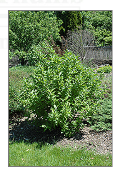
Arctic Fire Red Twig Dogwood