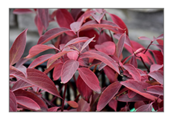
Arctic Fire Red Twig Dogwood in fall

Arctic Fire Red Twig Dogwood will grow to be about 4 feet tall at maturity, with a spread of 4 feet. It tends to fill out right to the ground and therefore doesn't necessarily require facer plants in front. It grows at a fast rate, and under ideal conditions can be expected to live for approximately 20 years.