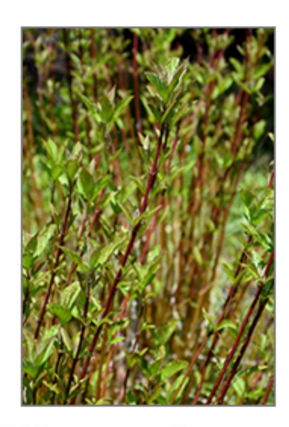
Arctic Fire Red Twig Dogwood stems

This shrub will require occasional maintenance and upkeep, and can be pruned at anytime. It is a good choice for attracting birds to your yard. Gardeners should be aware of the following characteristic(s) that may warrant special consideration;