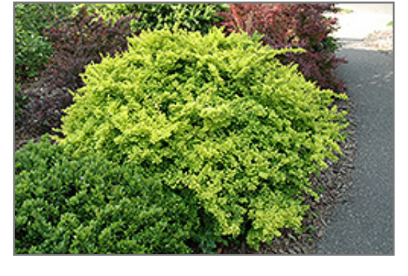
Golden Japanese Barberry

Golden Japanese Barberry has attractive yellow deciduous foliage on a plant with a round habit of growth. The small oval leaves are highly ornamental and turn an outstanding burgundy in the fall. It has clusters of yellow flowers hanging below the branches in mid spring, which are interesting on close inspection. The fruits are showy red drupes displayed from early to late fall.