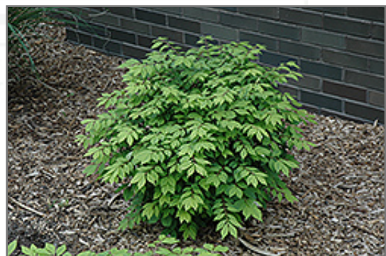
Little Moses Burning Bush