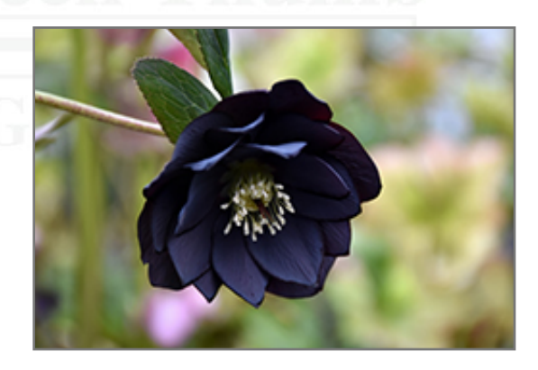
Onyx Odyssey Hellebore flowers