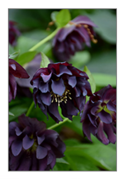
Onyx Odyssey Hellebore flowers

Onyx Odyssey Hellebore is an herbaceous evergreen perennial with an upright spreading habit of growth. Its medium texture blends into the garden, but can always be balanced by a couple of finer or coarser plants for an effective composition.