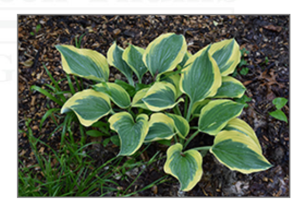
Liberty Hosta

This is a relatively low maintenance plant, and is best cleaned up in early spring before it resumes active growth for the season. Gardeners should be aware of the following characteristic(s) that may warrant special consideration;