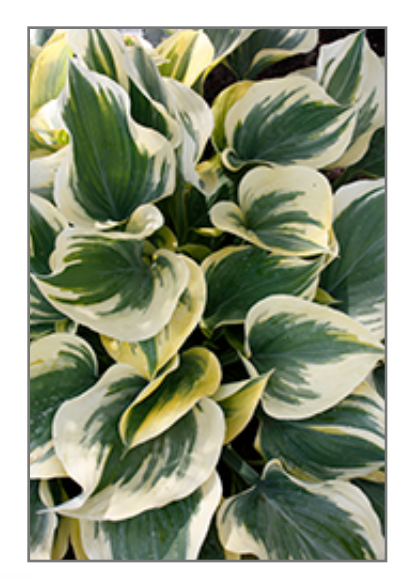
Liberty Hosta foliage

Liberty Hosta is a dense herbaceous perennial with tall flower stalks held atop a low mound of foliage. Its relatively coarse texture can be used to stand it apart from other garden plants with finer foliage.