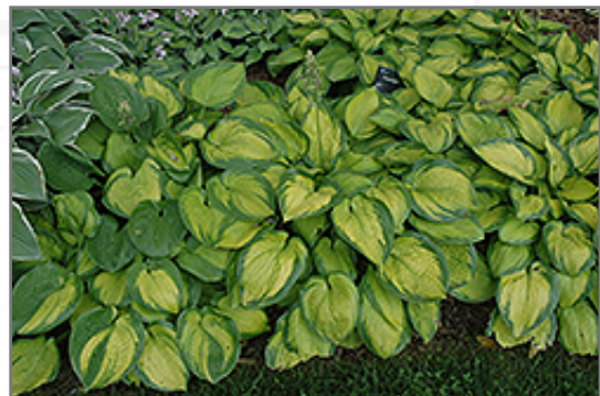
Paradigm Hosta