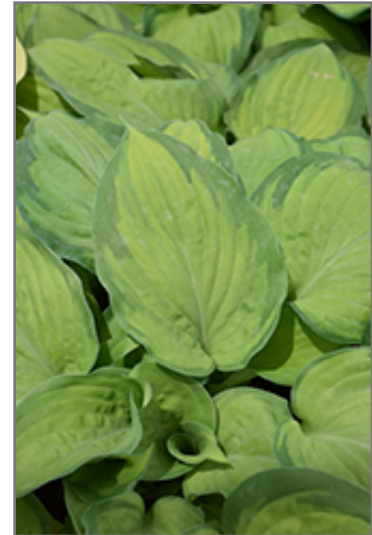
Paradigm Hosta foliage

This plant does best in partial shade to shade. It prefers to grow in average to moist conditions, and shouldn't be allowed to dry out. It is not particular as to soil type or pH. It is somewhat tolerant of urban pollution. This particular variety is an interspecific hybrid. It can be propagated by division; however, as a cultivated variety, be aware that it may be subject to certain restrictions or prohibitions on propagation.