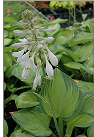
Paradigm Hosta flowers

Paradigm Hosta is a dense herbaceous perennial with tall flower stalks held atop a low mound of foliage. Its medium texture blends into the garden, but can always be balanced by a couple of finer or coarser plants for an effective composition.