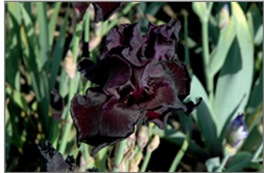
Before The Storm Iris flowers